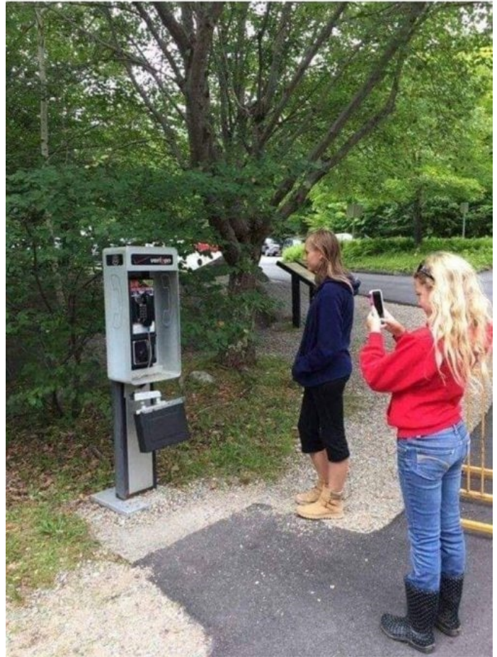
Kids exploring ancient ruins

In the end, you ignore everything and click "I agree".