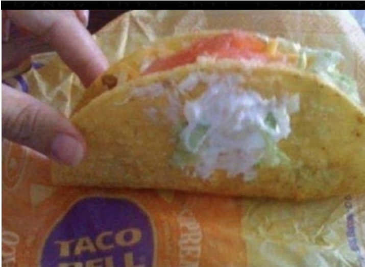
She asked for sour cream on the side...