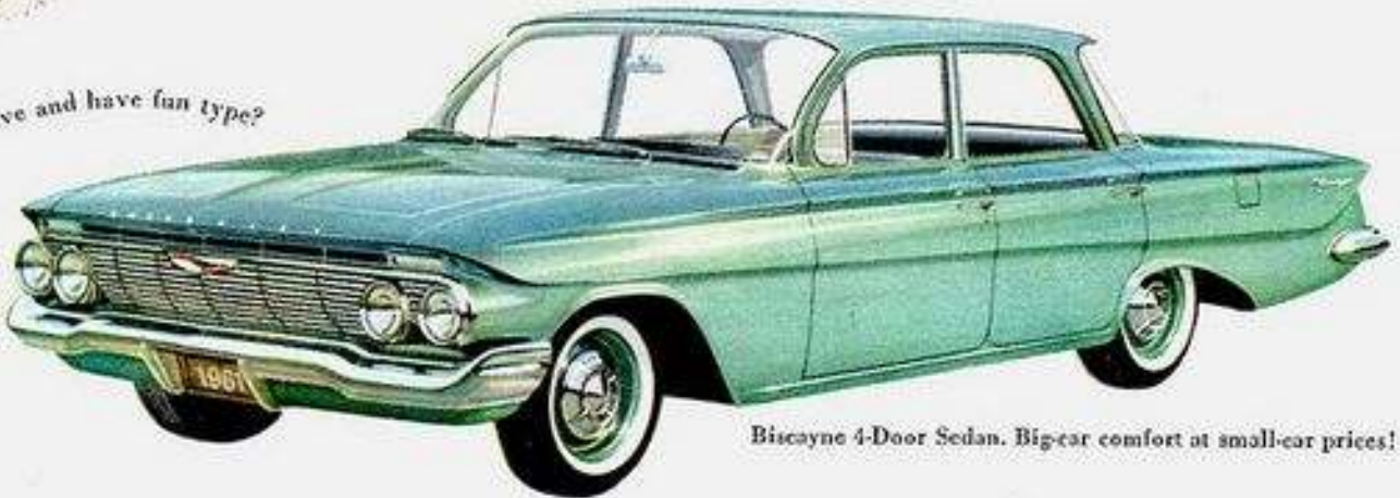
Biscayne 4-Door Sedan. Big-car comfort at small-car prices!

Q. Why shouldn't you tell an Easter egg a good joke? A. It might crack up!