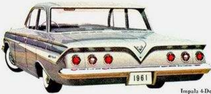
Impala 4-Door Sedan